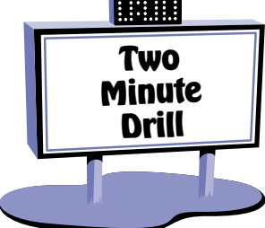
Two Minute Drill Area Preview Capsules